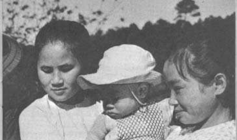
Young faces of Vietnam.

Since the purpose of marriage is to continue the family line, the parents believe that the selection of a proper wife for their son is their personal responsibility, a duty they owe both to their ancestors and to their son and his future children. Usually with the help of a "go-between," they search for a girl who is skillful at housework and who will be a good mother to many children. Beauty is not as desirable as good character. In fact, beauty is sometimes considered