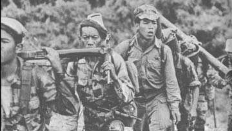
Montagnard "Strike Force" was trained by Americans.

largely of villagers who live and serve near their homes. Together with the Regional Force, they bear the brunt of the day-to-day fighting against the Viet Cong. In many ways these and other paramilitary groups could be compared to American minutemen during the Revolutionary War. They are being supplied with up-to-date weapons and field radios. The radios have filled a big communications gap. With them, help can be summoned fast or news of an impending attack flashed to the critical area.