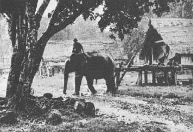
People of four mountain tribes live in this village.

There is also a village market. On market day, which is once or twice a week, people file out of the hamlets to follow the narrow paths or rice paddy banks to the marketplace. They come to sell, to buy, or just to gossip. Some balance baskets of fresh fruits and vegetables on their heads.