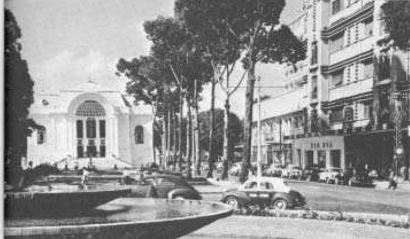
National Assembly meets in white building (left)

Saigon is the capital and largest city of Vietnam. With its predominantly Chinese city of Cholon (meaning "big market"), it lies