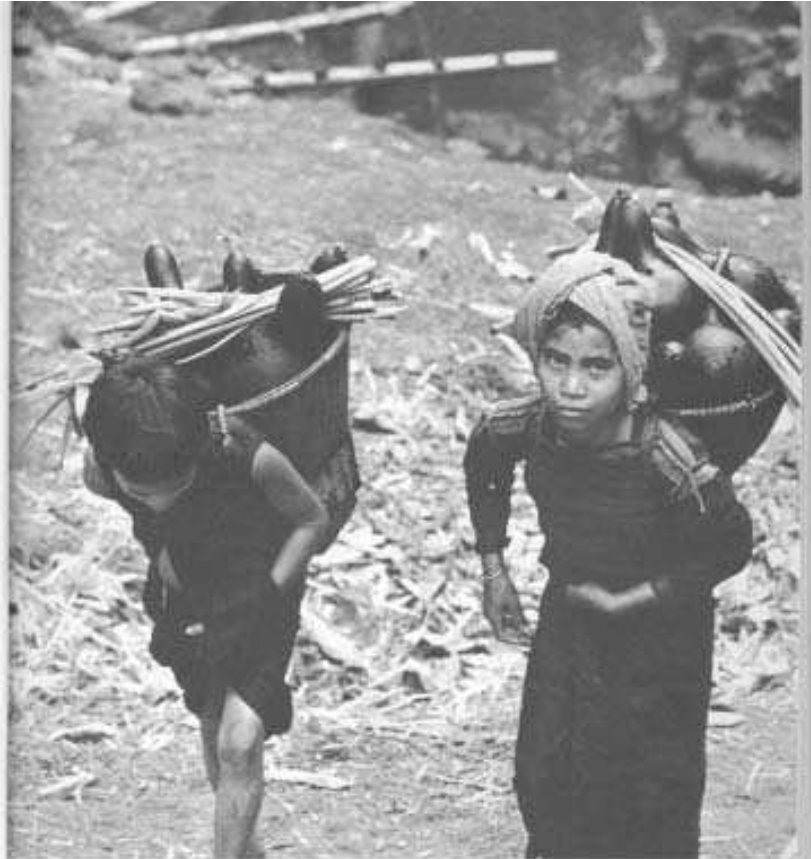
Rhade girls carry water home in gourds.

Also, none of these people ever had a written language of their own until French and American missionaries began devising them, mostly in this century. Comparatively few tribespeople know how to read, so if you want to study their language you do so by ear not by book.