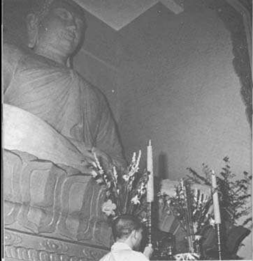
Buddhist rites are ages old.