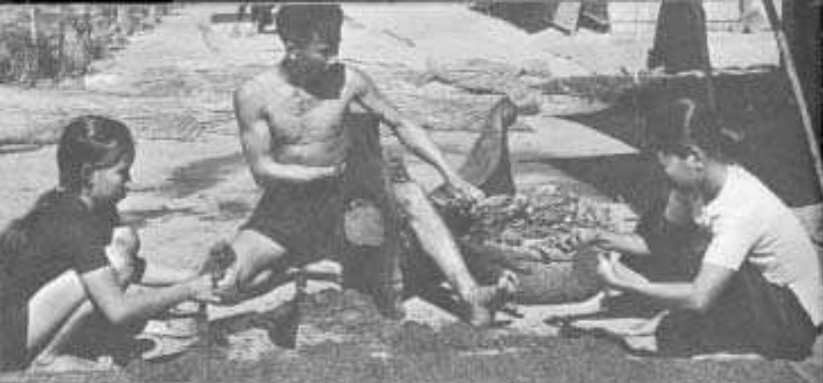
Farm family prepares tobacco for market.