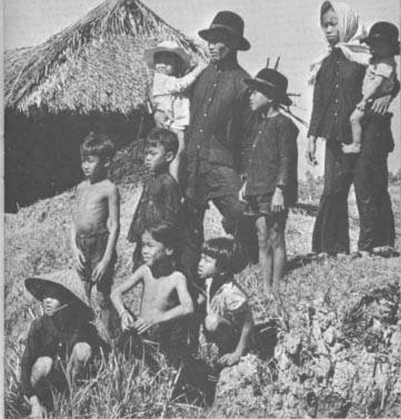
Portrait of a Vietnamese farmer and his family.

The traditional family unit includes living and dead members and members not yet born. On festival days and in family ceremonies the ancestors are revered, and at all times there is thought of the grandsons and great-grandsons yet to be born who will carry