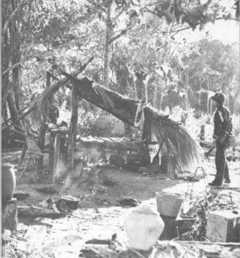
Viet Cong hideout is captured by Vietnamese troops.

Political activity has been confined chiefly to the cities and has had little impact on the great bulk of the population living in the countryside. These people—the villagers, the rice farmers, the rubber plantation workers—have had little feeling of identification with either the Viet Cong or the central Government. The Vietnamese