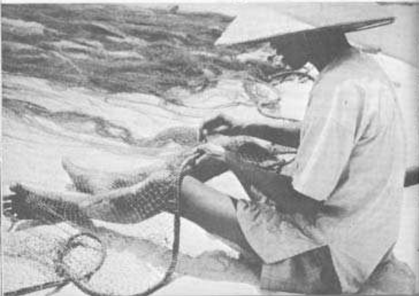
Fisherman mends his giant net.