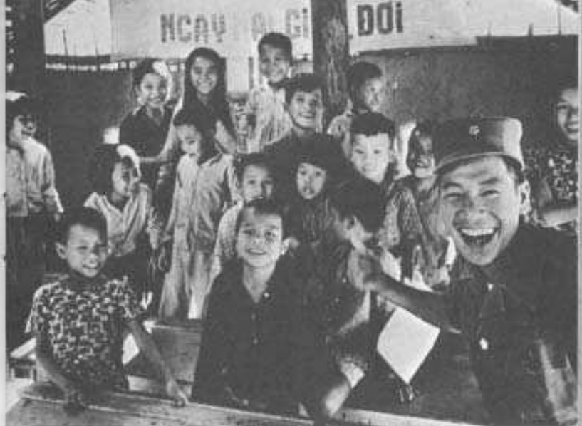
Army officer jokes with school children.

The Vietnamese village, lang and xa , is an administrative unit rather like a county in the United States. It is made up of a number of scattered hamlets or ap , each set against a backdrop of bamboo thickets and groves of areca (betel nut) and coconut palms. Located at the village seat of government are a school, athletic or parade