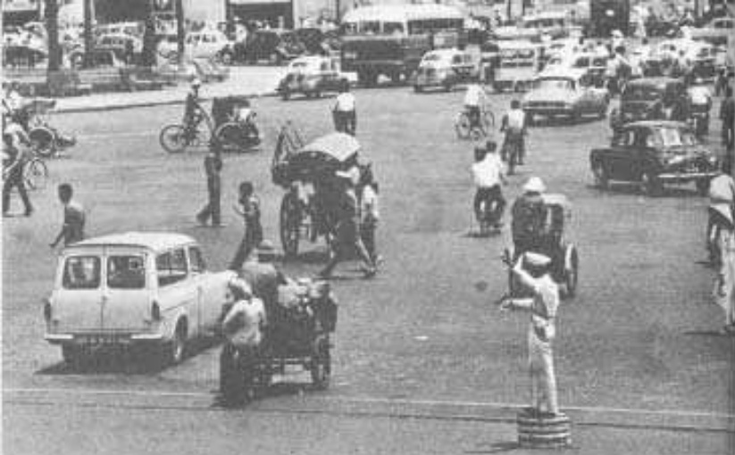
Variety of vehicles spices Saigon traffic.