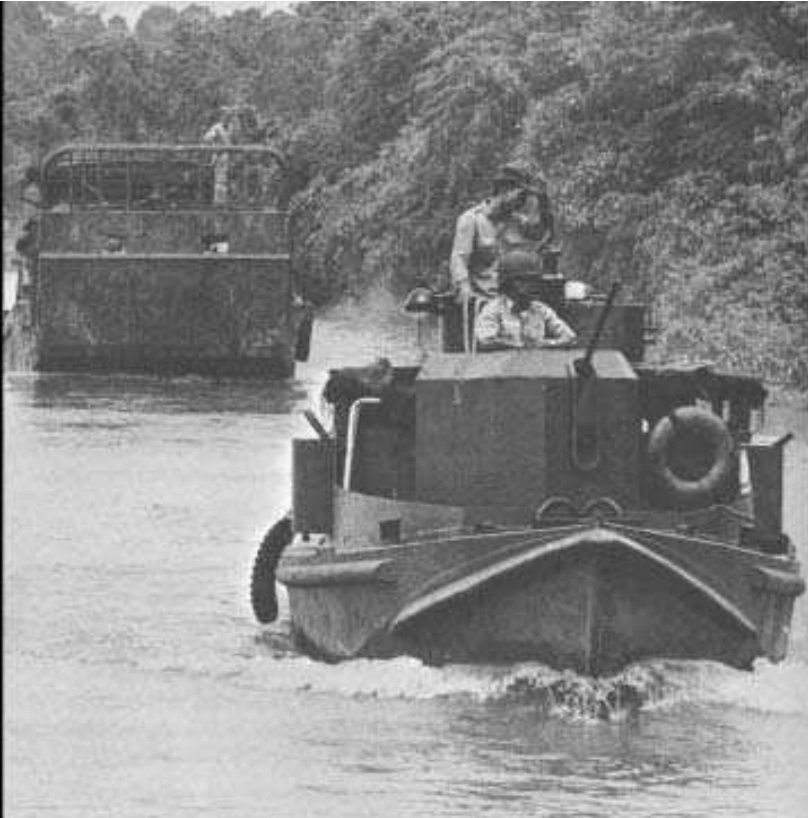
Armor protects Vietnamese Navy supply convoy.