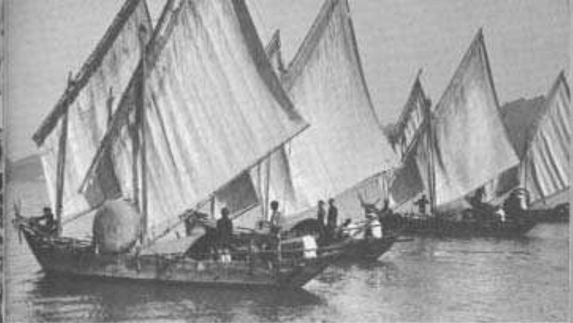
A Vietnamese Navy Junk Force patrol.

The Army. The South Vietnamese Regular Army and paramilitary forces number more than 500,000 men. All physically fit young men of 20 and 21 are normally required to perform two years of military service. This requirement is altered to include additional