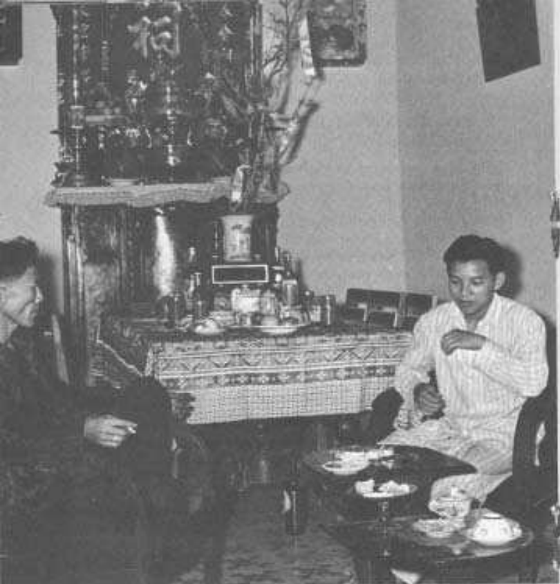
Tet Nguyen Dan (New Year) is observed quietly by some.