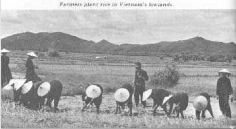
Farmers plant rice in Vietnam's lowlands.