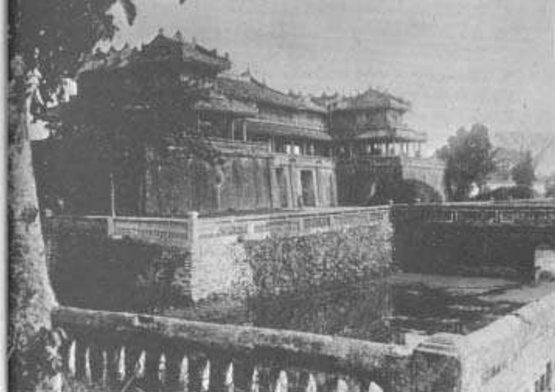
The former imperial Palace in Hué.

The Government has restored a few of the buildings. You can see the Emperor's Audience Hall with its gilt throne and red, dragon-