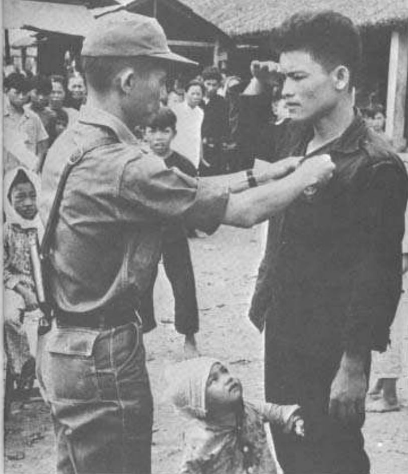
Vietnamese is decorated for defending his village.

The new Rural Life Hamlet program, part of the Rural Reconstruction or Pacification program, is designed to provide physical safety, effective local government, and a better life for the rural population. A typical hamlet has rudimentary fortifications and warning systems. The inhabitants are trained and armed to protect themselves against Viet Cong attack until reinforcements arrive. As security improves, Government services in such fields as health, education, and agriculture are provided, in many cases with U. S. assistance. Local officials, who are trained and paid by the Government and administer the hamlet, are usually chosen in hamlet elections. The program is designed to provide the improved security and economic conditions that encourage loyalty to the central Government.