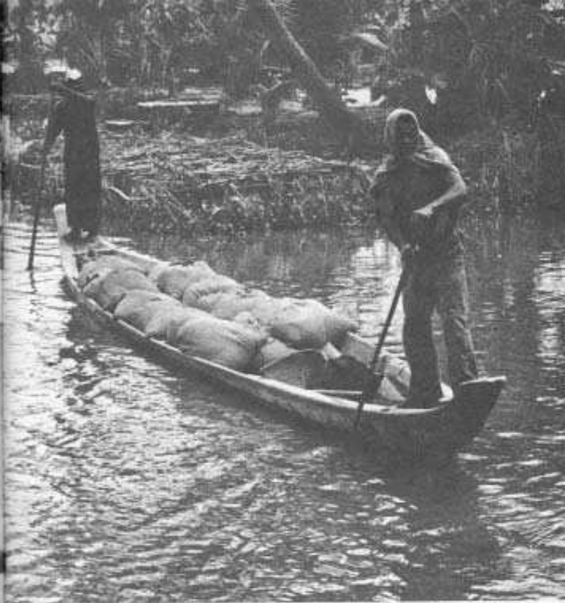
Muscle-powered sampans are typical of Mekong Delta.