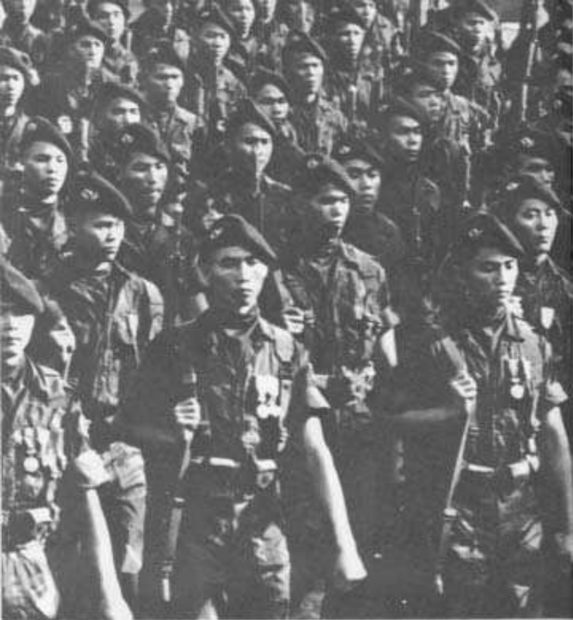
Determined-looking troops of Vietnamese Army.