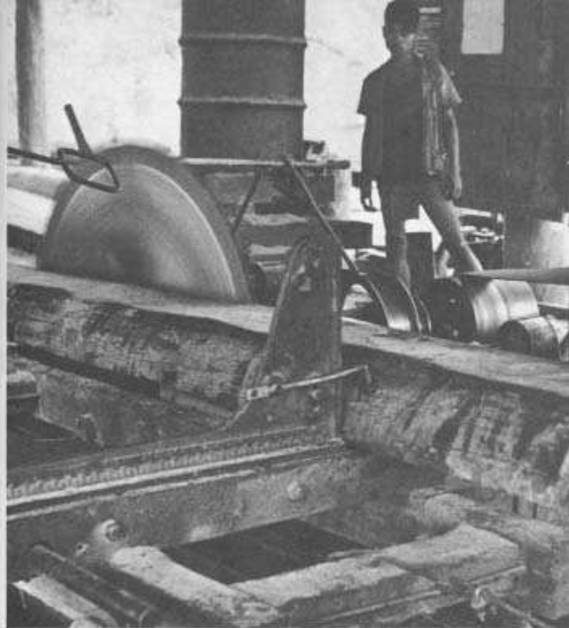
Timber is trimmed in Vietnamese sawmill.