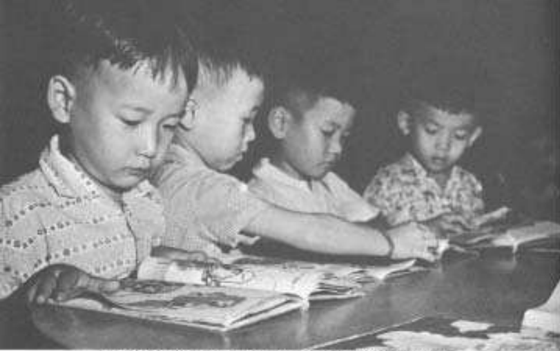
Schoolbooks capture the attention of young students.