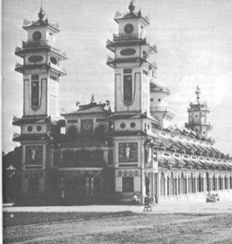
This elaborate Cao Dai temple is near Tay Ninh.

New Religions. In addition to the religions and philosophies brought to Vietnam from other countries, new ones were developed there.