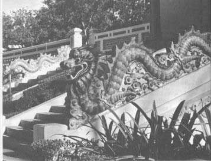
Dragons guard war memorial entrance in Saigon.

and often the design includes bats or butterflies in the corners of the rug to signify happiness.