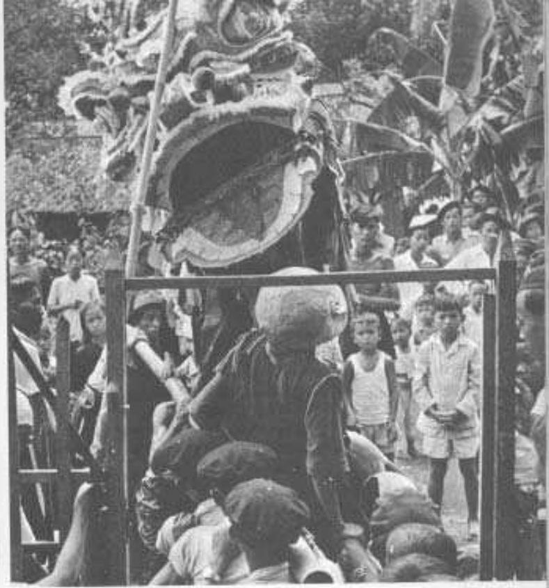
Tet Nguyen Dan is celebrated boisterously by others.