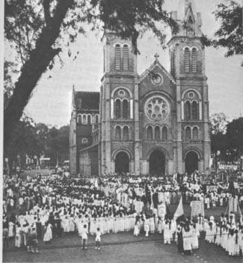
Procession before Saigon's Catholic Cathedral.