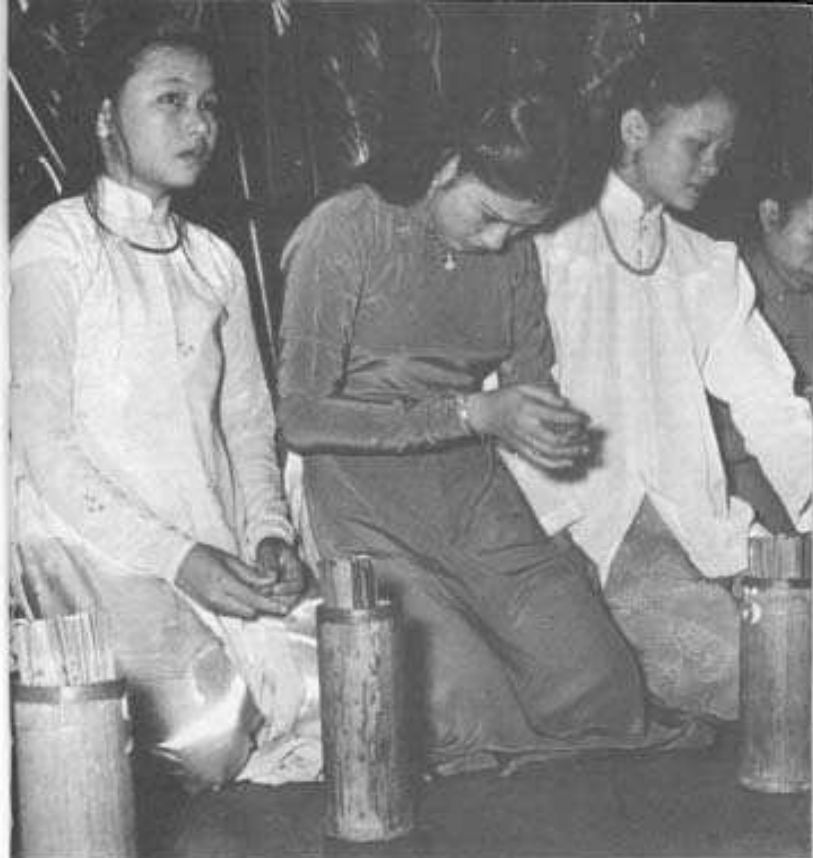
Religion is important to the Vietnamese.

Religion has been a significant factor in the Vietnam way of life throughout history. The present culture and customs of these proud and sensitive people are strongly conditioned by their religious beliefs. For example, feeling that the universe and man's place in it are essentially preordained and unchanging, they place high value on stoicism, patience, courage, and resiliency in the face of adversity.