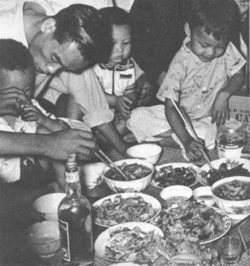
Vietnamese food delights both eye and palate

nut." Among the vegetables are common ones like potatoes, turnips, carrots, onions, and beans; eggplant disguised under the name aubergine , and water bindweed, an herb that comes from the same family as our morning-glory flower.